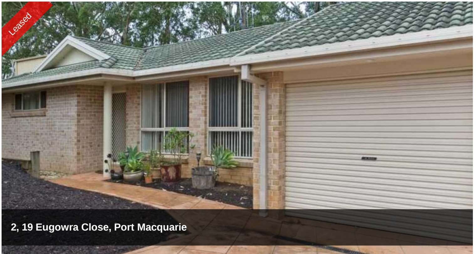
2, 19 Eugowra Close, Port Macquarie