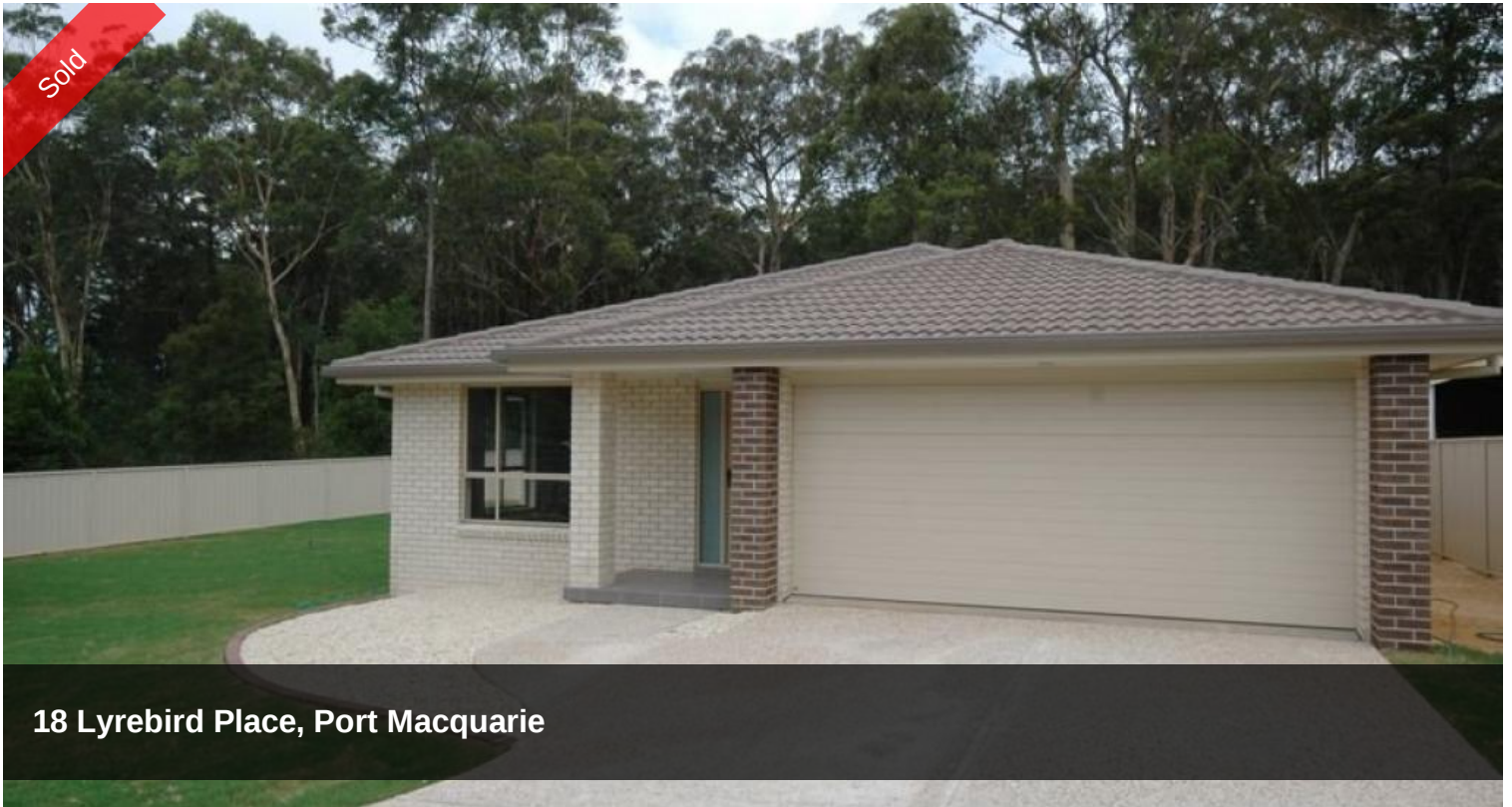
18 Lyrebird Place, Port Macquarie