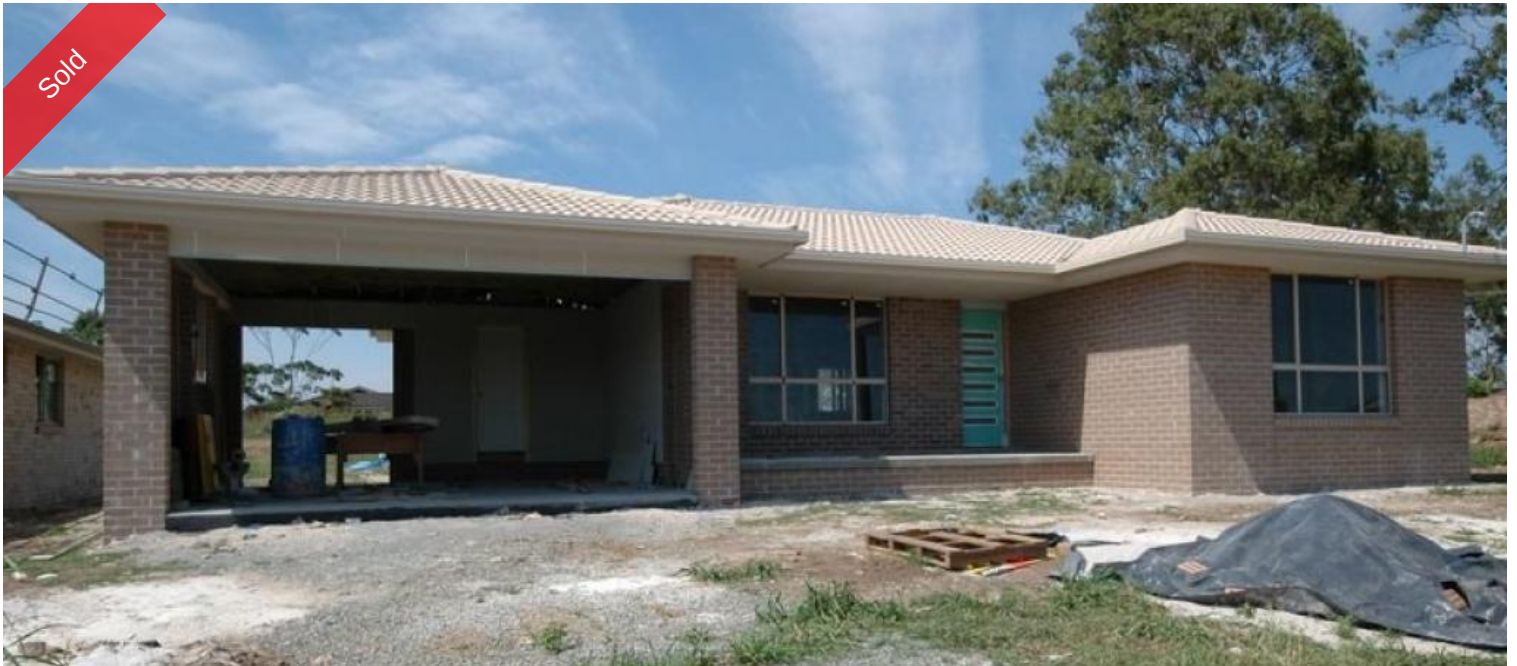
27 Sherwood Road, Port Macquarie