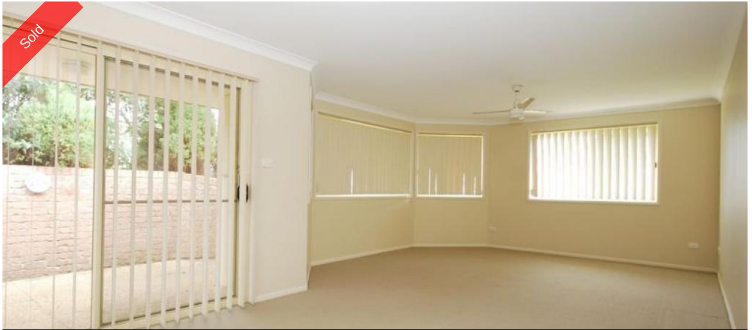
1, 76 Gore Street, Port Macquarie