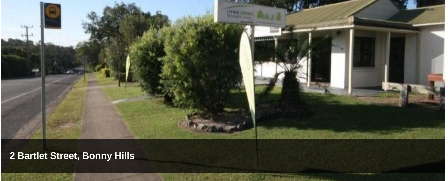
2 Bartlet Street, Bonny Hills