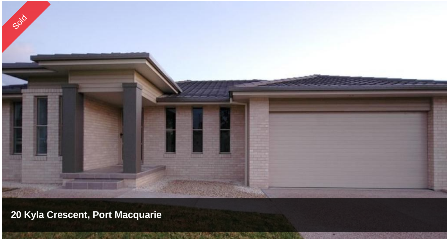
20 Kyla Crescent, Port Macquarie