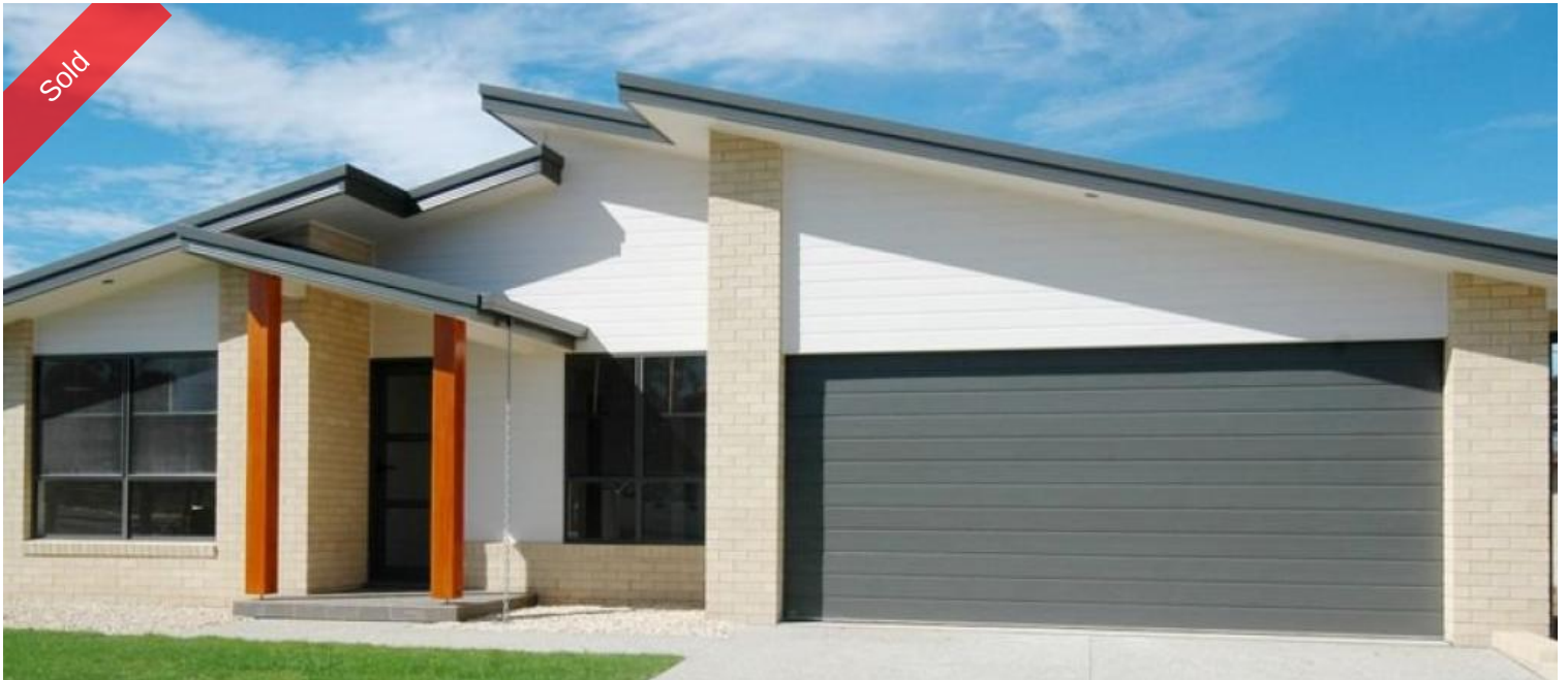
16 Kyla Crescent, Port Macquarie