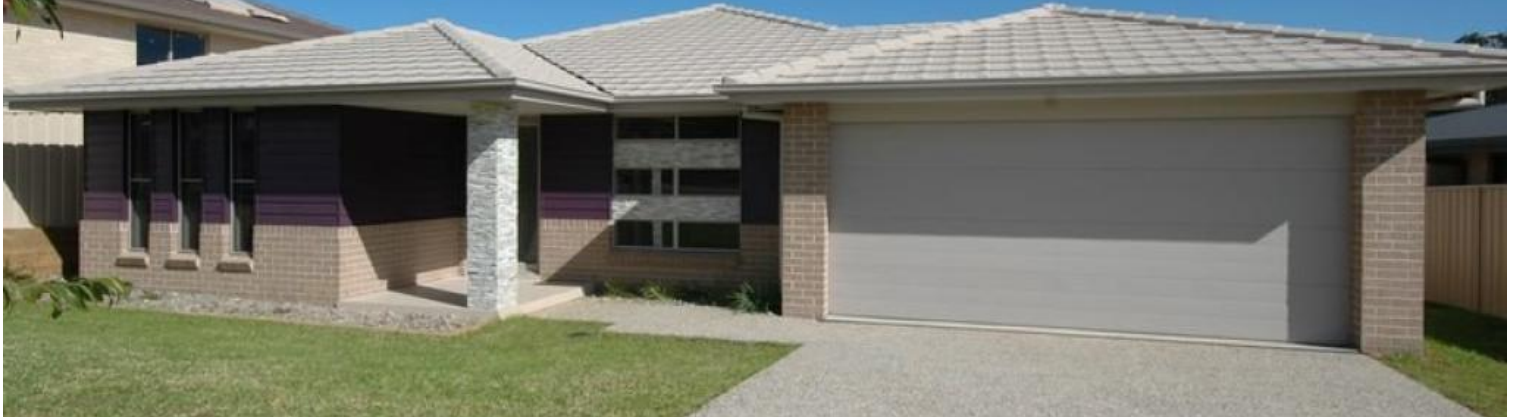
18 Kyla Crescent, Port Macquarie