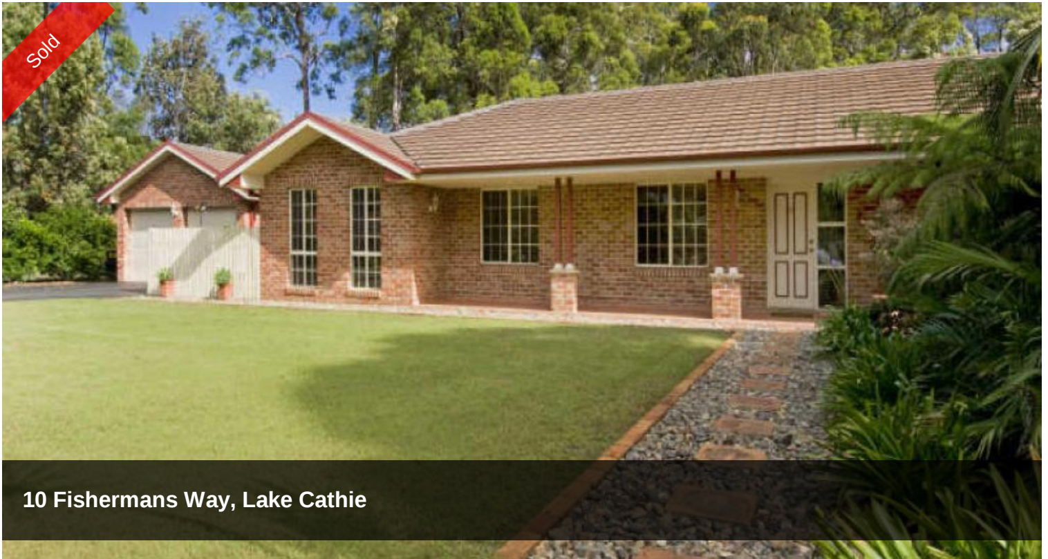
10 Fishermans Way, Lake Cathie