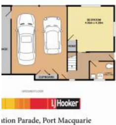
12 Plantation Parade, Port Macquarie