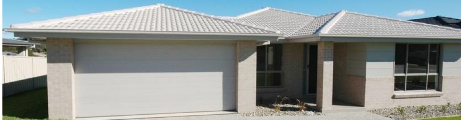
26 Kyla Crescent, Port Macquarie