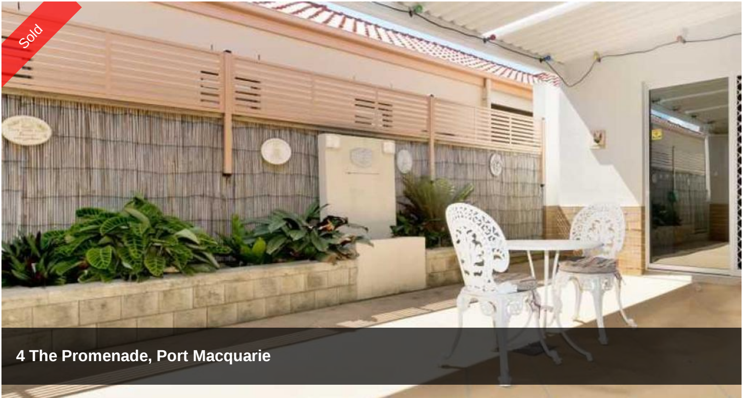
4 The Promenade, Port Macquarie