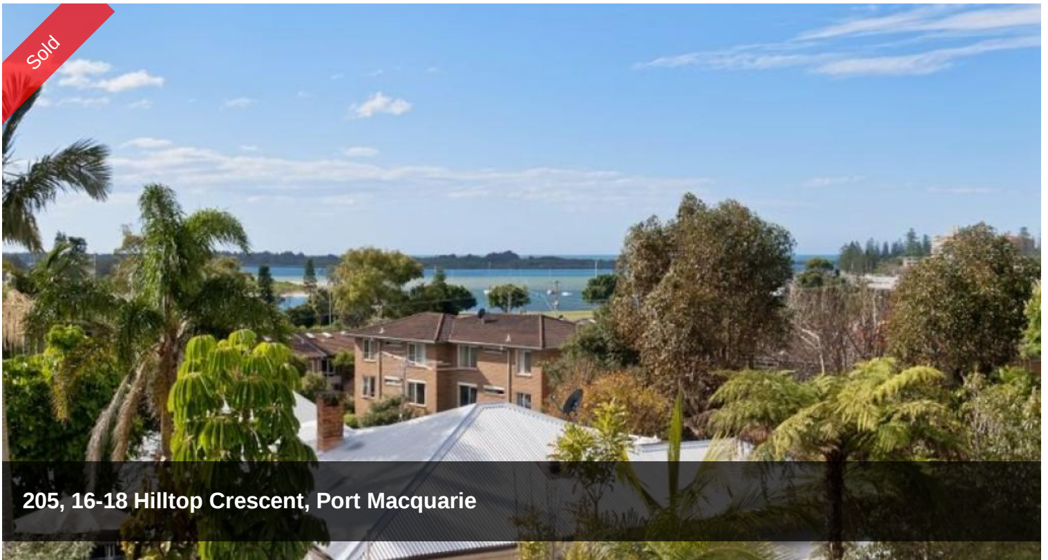
205, 16-18 Hilltop Crescent, Port Macquarie