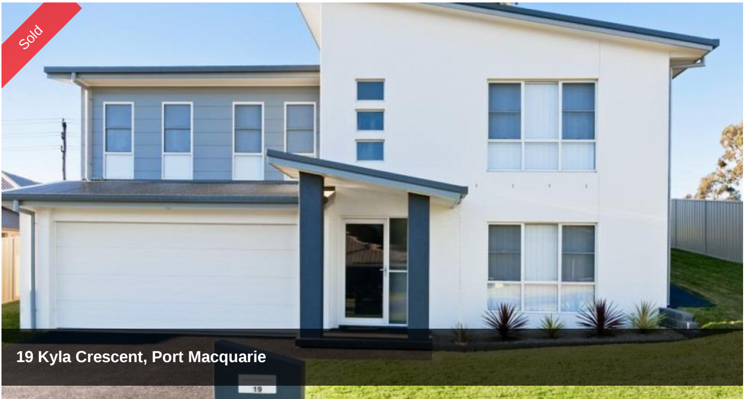
19 Kyla Crescent, Port Macquarie