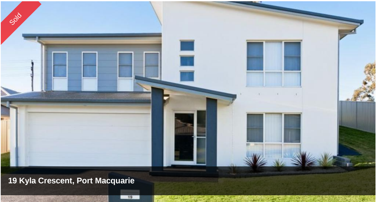
19 Kyla Crescent, Port Macquarie