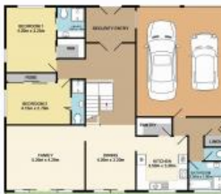
Hooker 13 Farrer Parade Port Macquarie