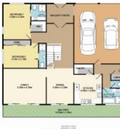
Hooker 13 Farrer Parade Port Macquarie