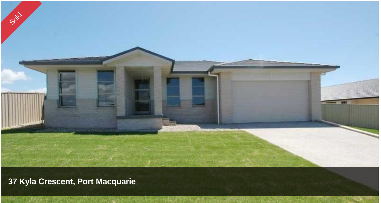
37 Kyla Crescent, Port Macquarie