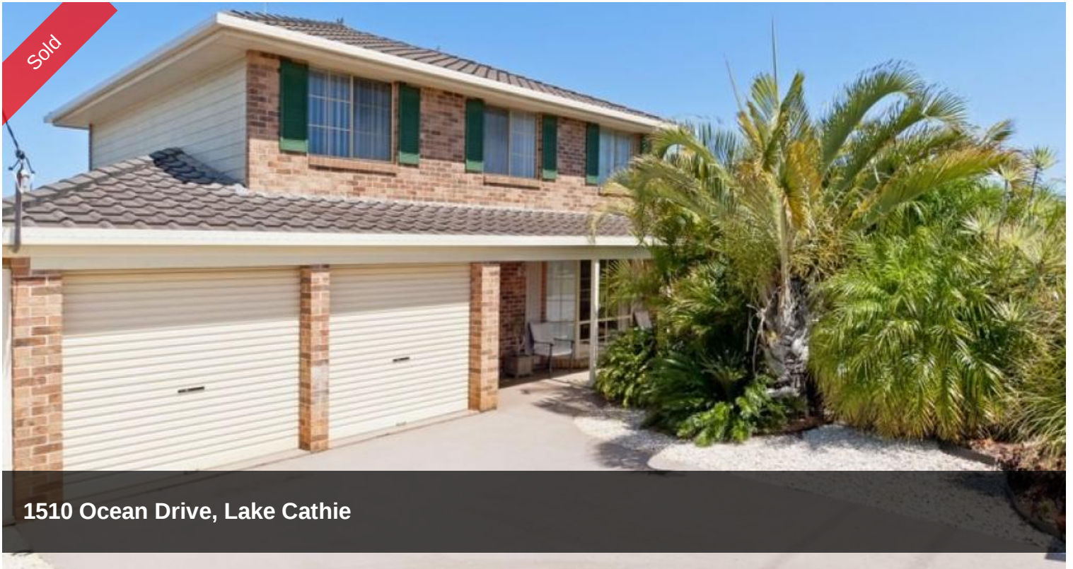
1510 Ocean Drive, Lake Cathie