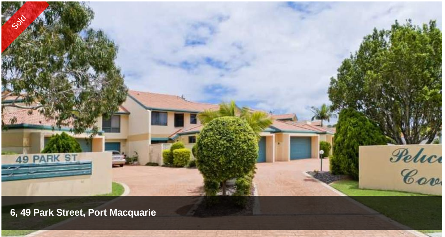
6, 49 Park Street, Port Macquarie