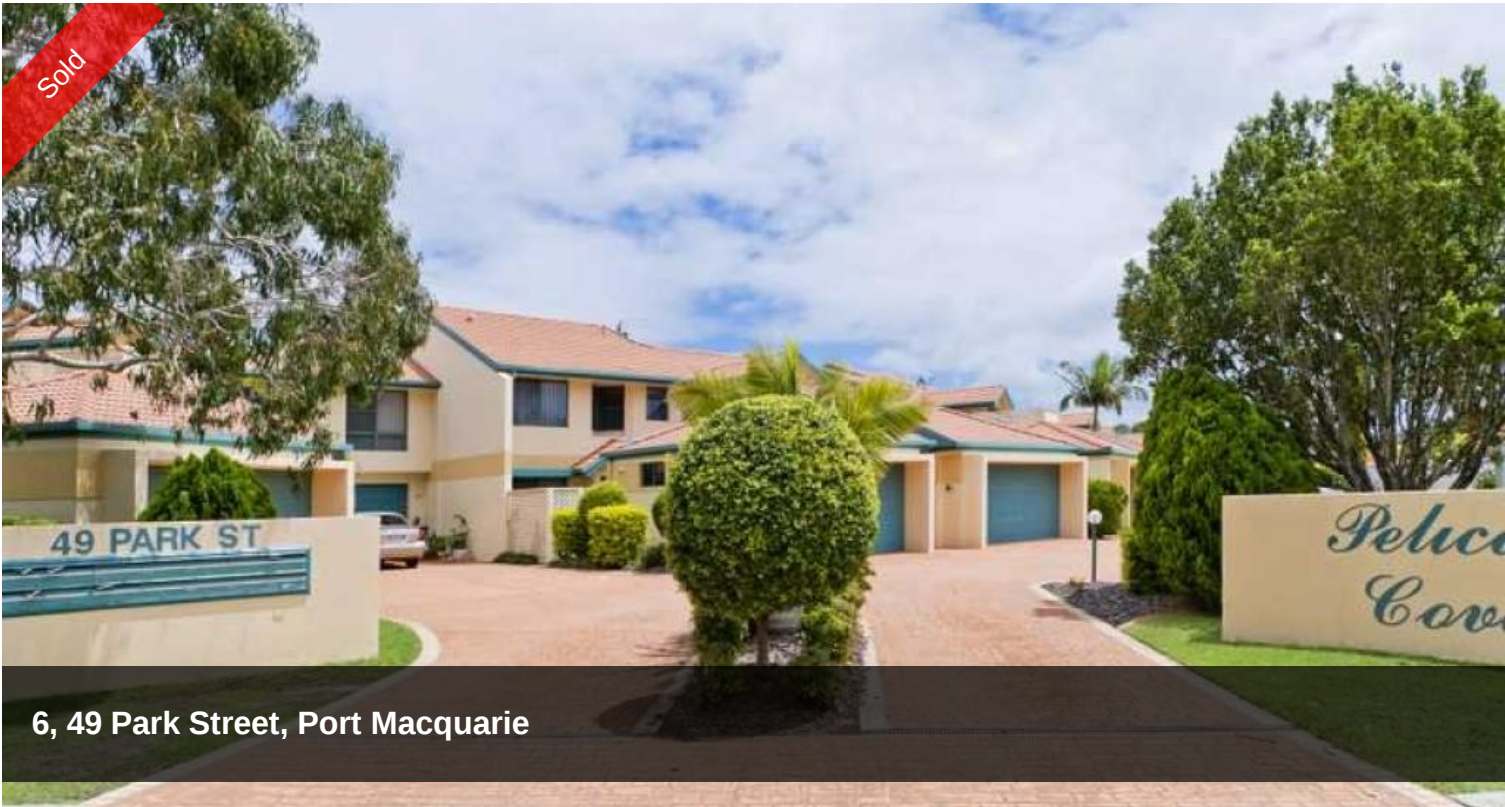
6, 49 Park Street, Port Macquarie