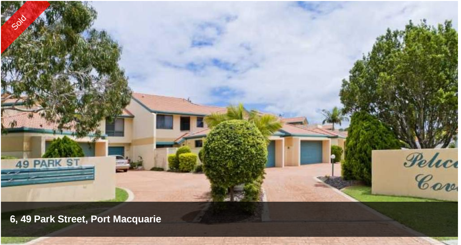
6, 49 Park Street, Port Macquarie