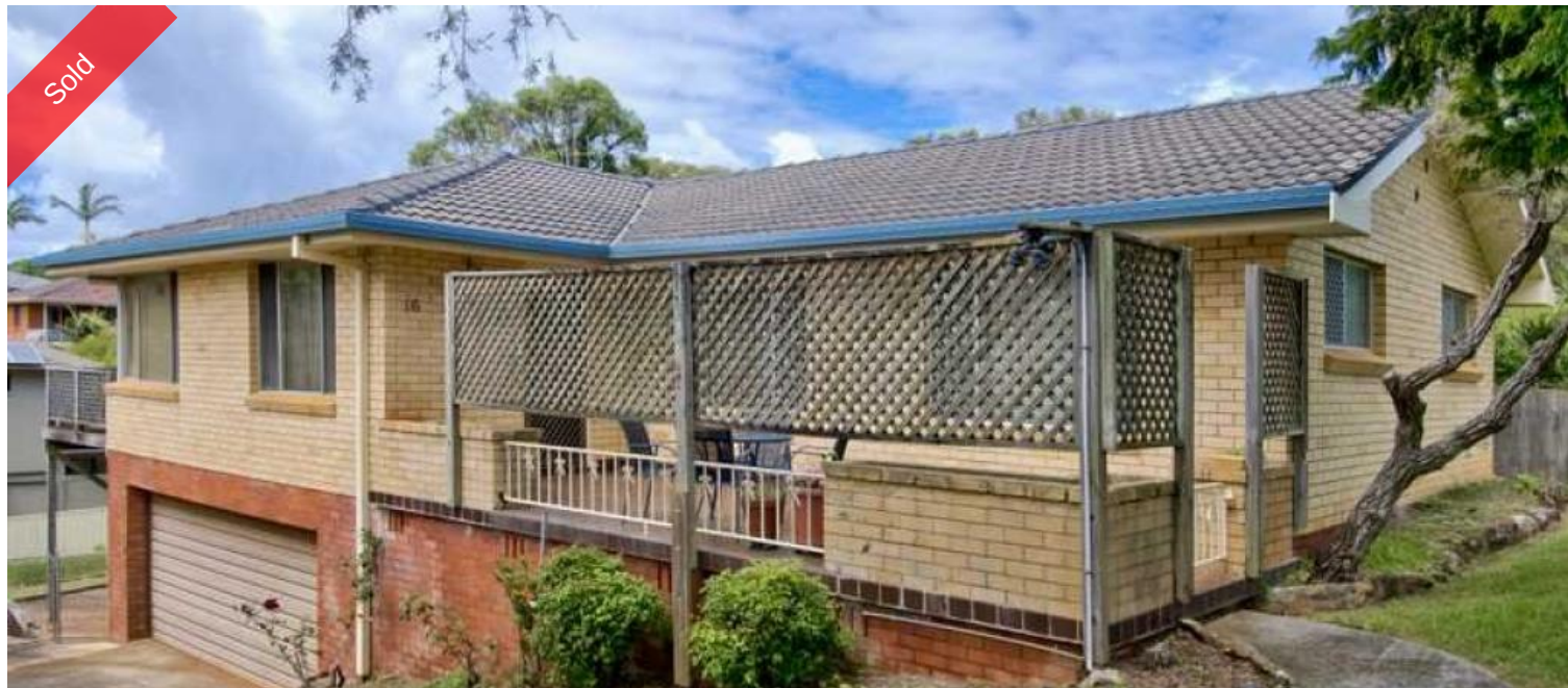
16 Grandview Parade, Port Macquarie