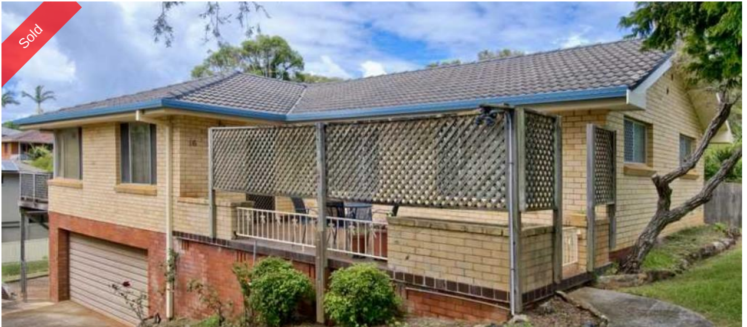
16 Grandview Parade, Port Macquarie