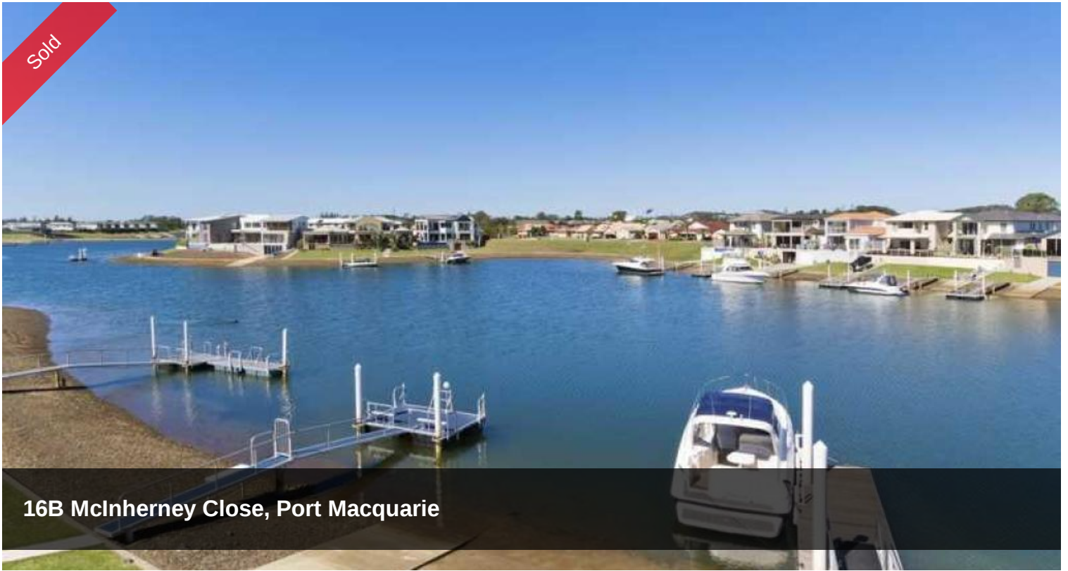
16B McInherney Close, Port Macquarie