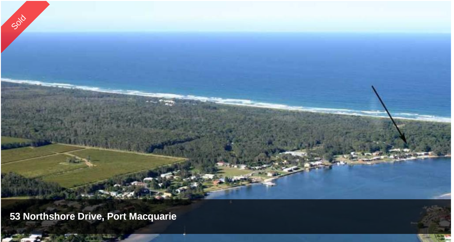
53 Northshore Drive, Port Macquarie