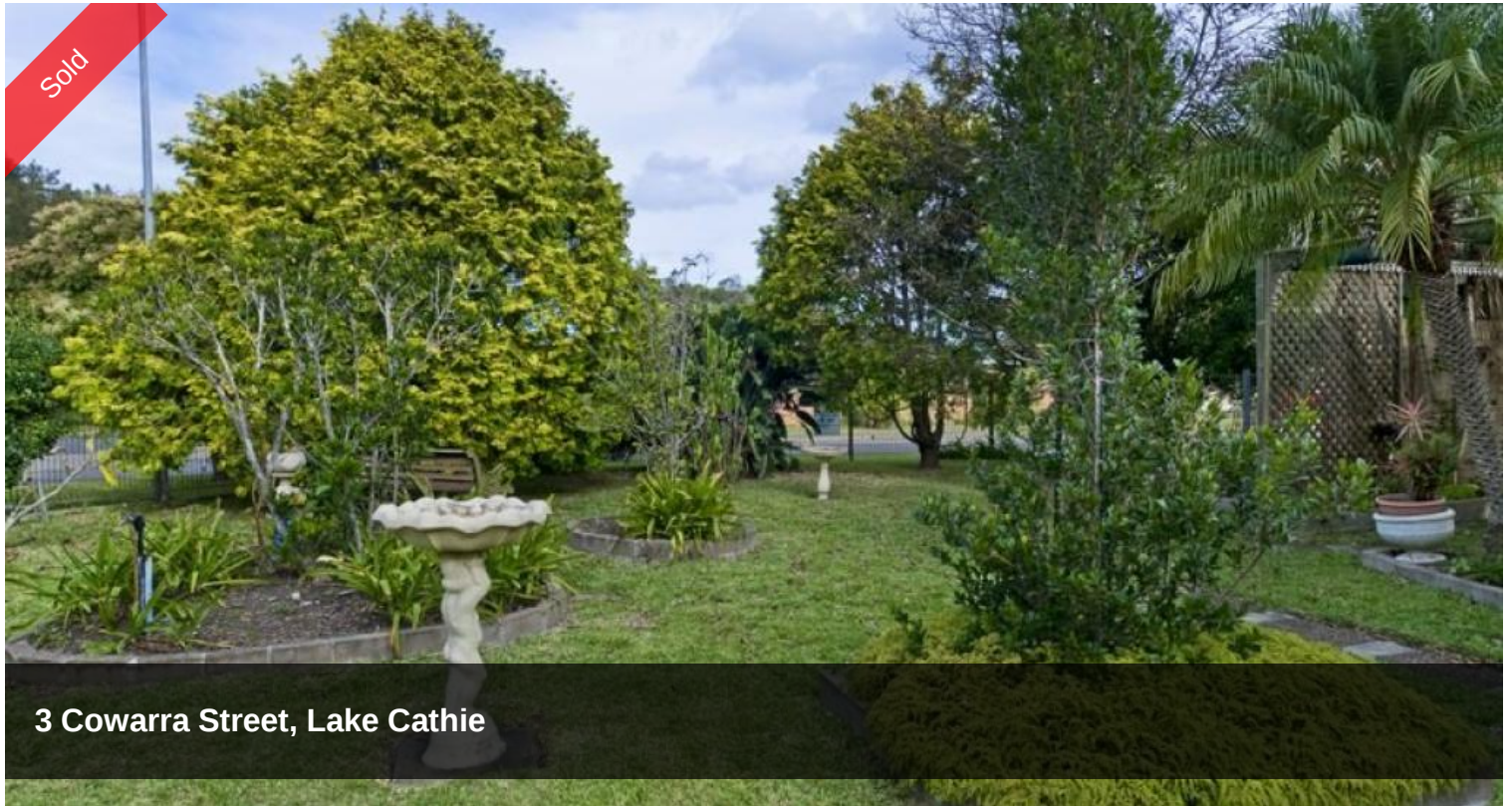
3 Cowarra Street, Lake Cathie