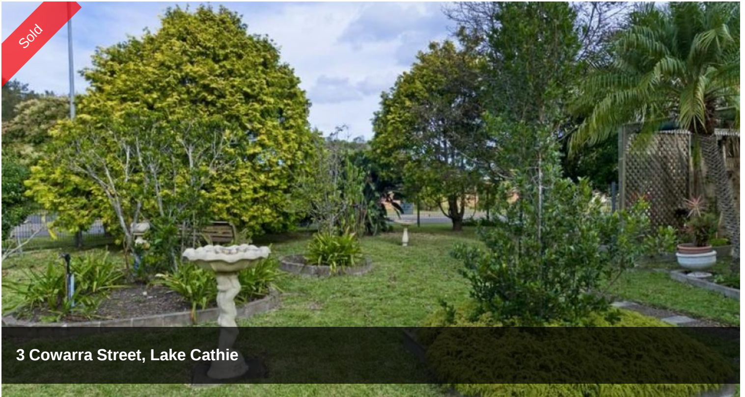
3 Cowarra Street, Lake Cathie