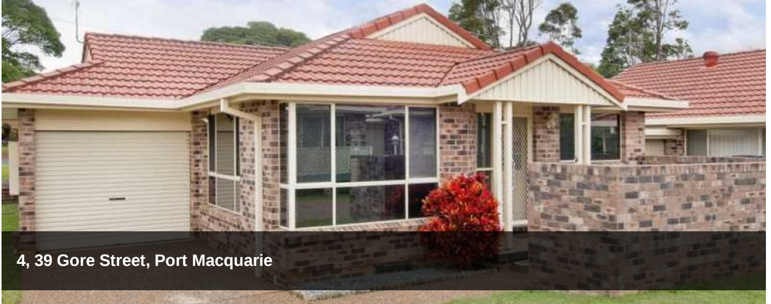
4, 39 Gore Street, Port Macquarie