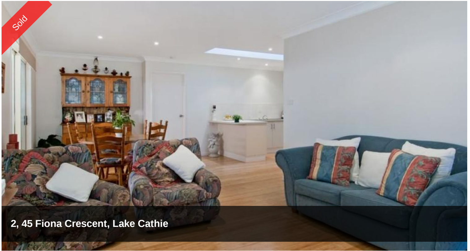
2, 45 Fiona Crescent, Lake Cathie