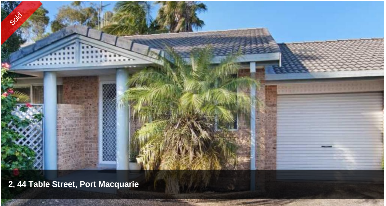
2, 44 Table Street, Port Macquarie