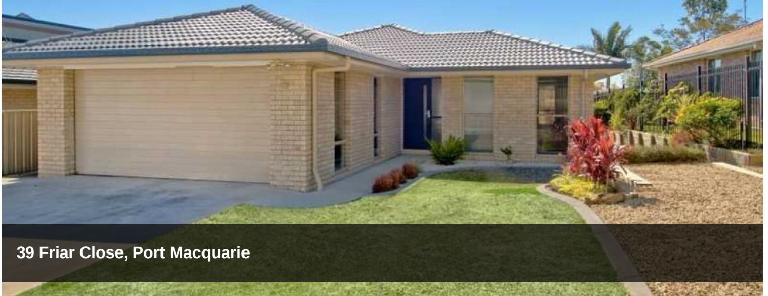
39 Friar Close, Port Macquarie