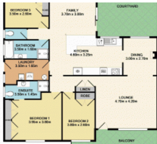
6 Woodvale Place Port Macquarie