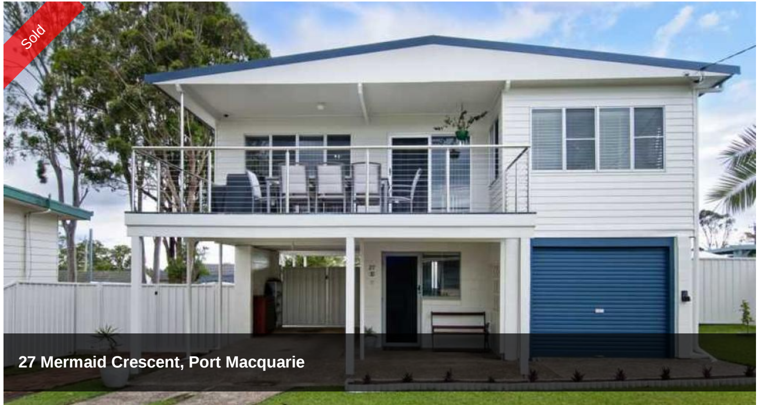
27 Mermaid Crescent, Port Macquarie