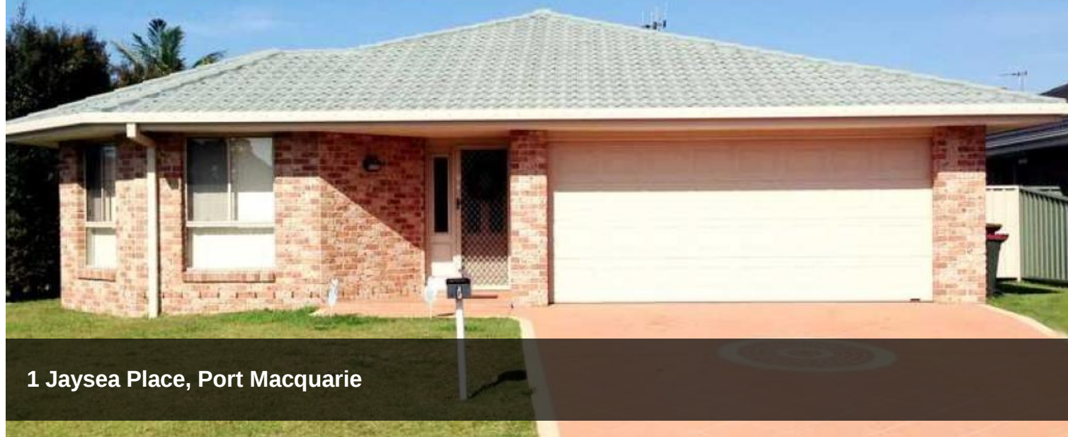
1 Jaysea Place, Port Macquarie