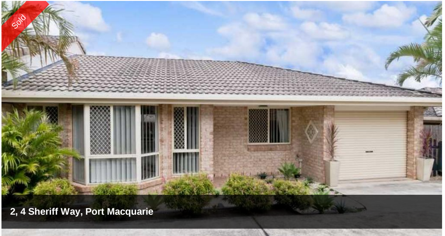
2, 4 Sheriff Way, Port Macquarie