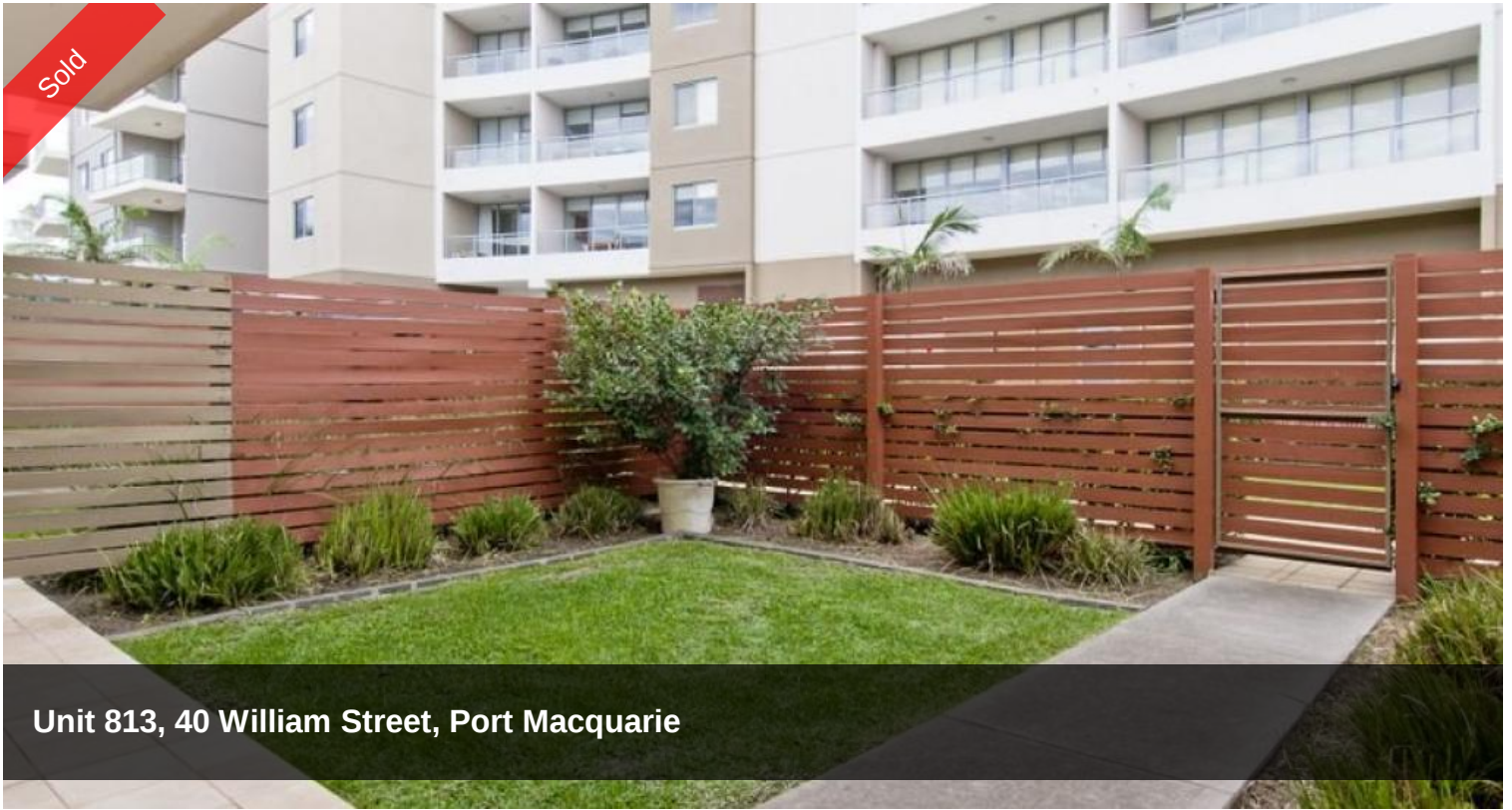
Unit 813, 40 William Street, Port Macquarie