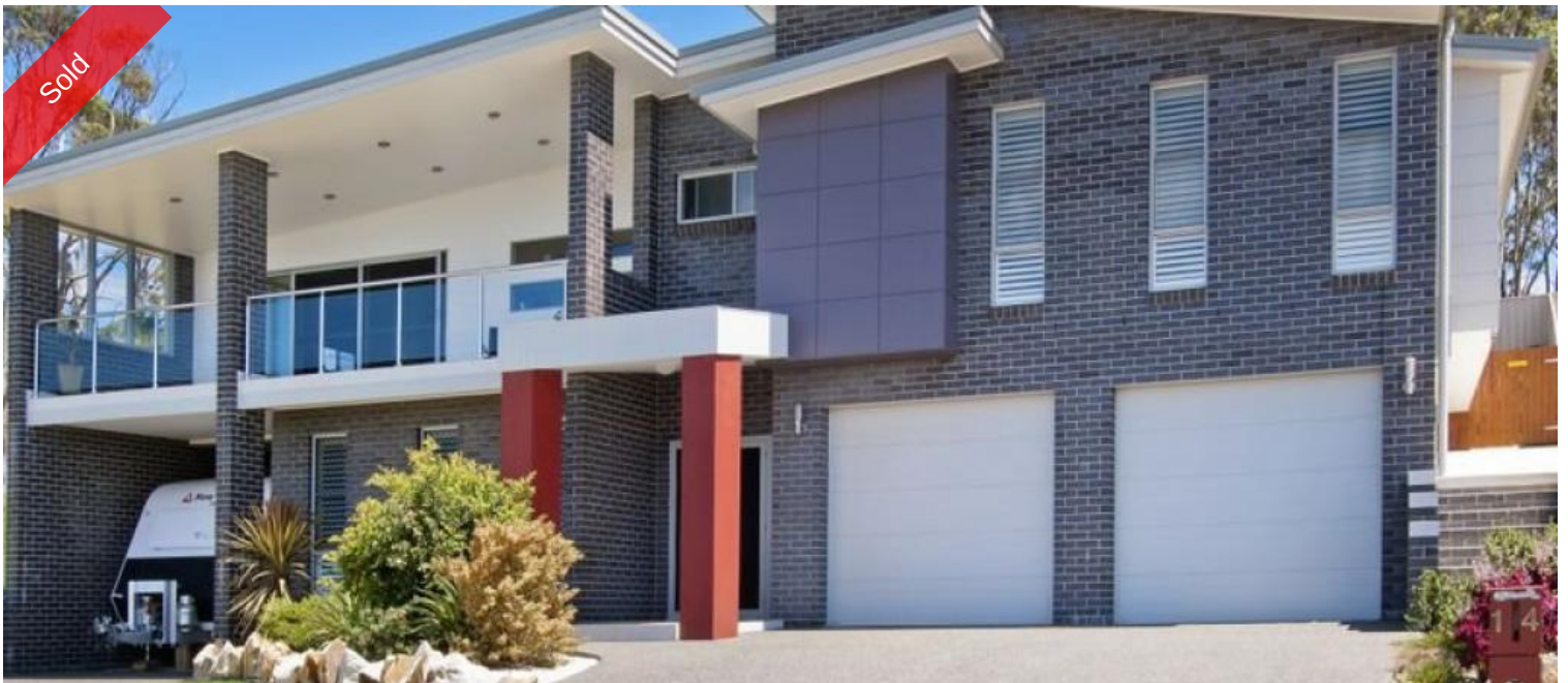
14 Timothy Place, Port Macquarie