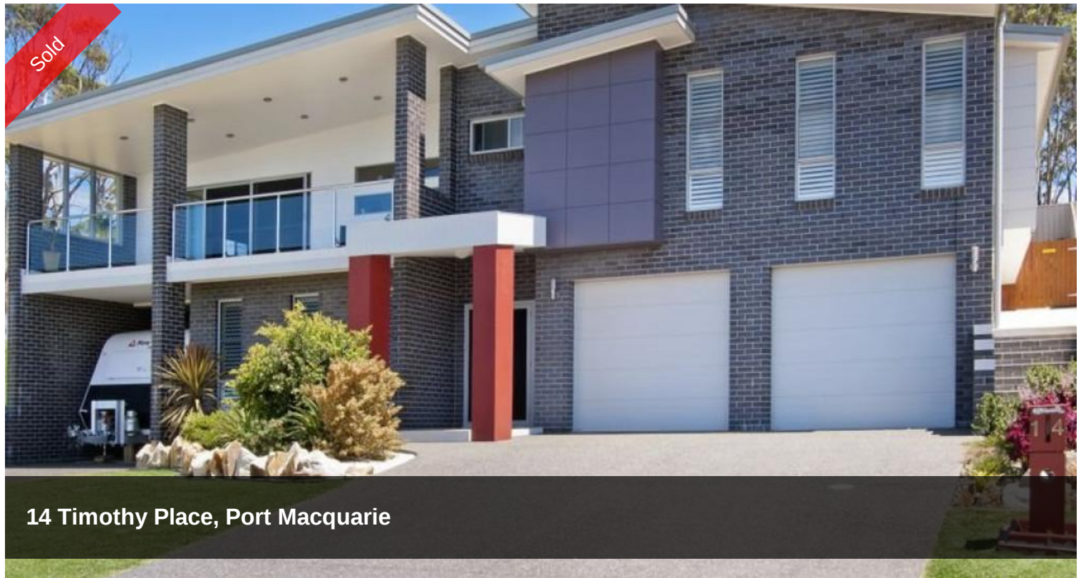
14 Timothy Place, Port Macquarie