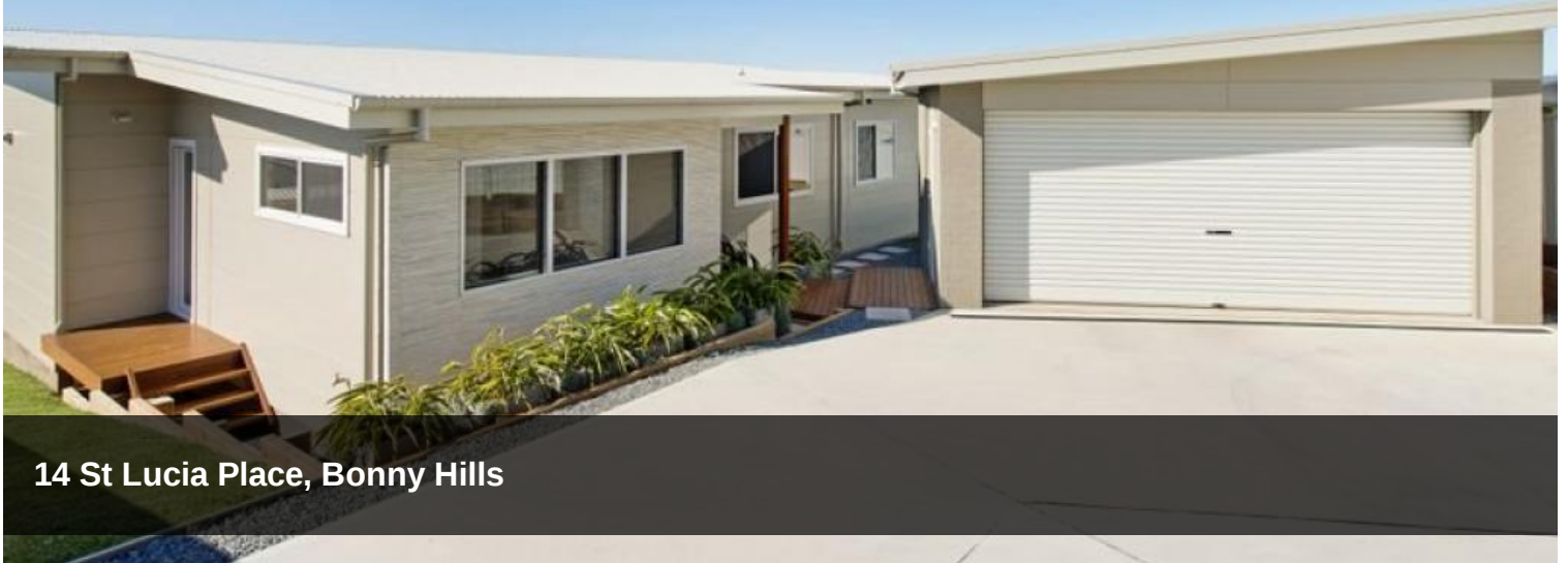
14 St Lucia Place, Bonny Hills