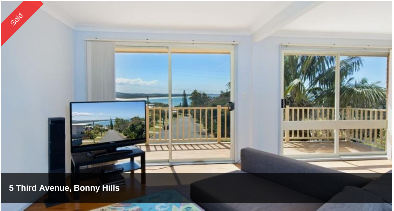
5 Third Avenue, Bonny Hills