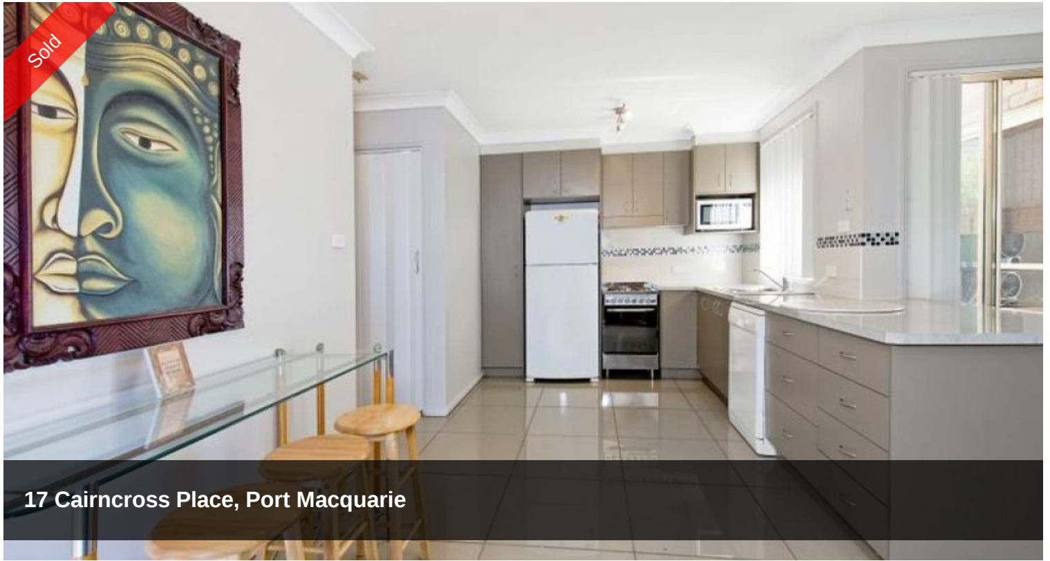
17 Cairncross Place, Port Macquarie