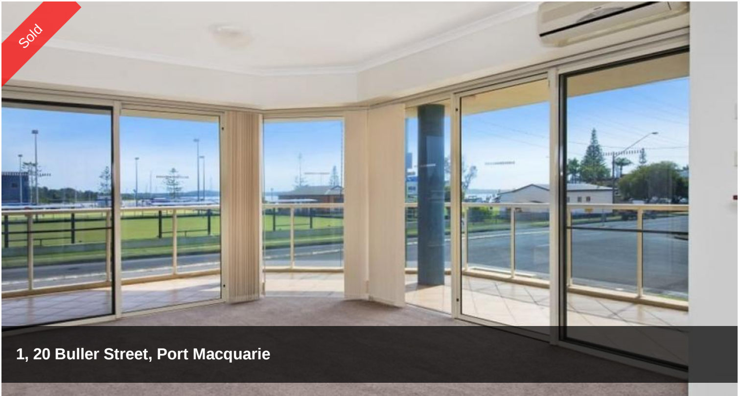
1, 20 Buller Street, Port Macquarie