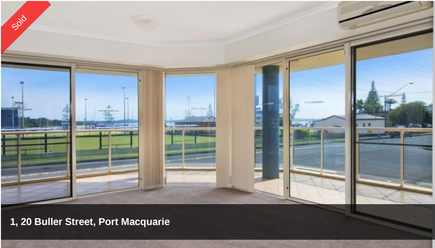
1, 20 Buller Street, Port Macquarie