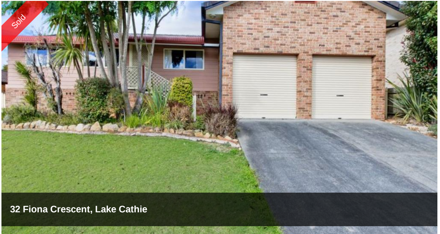
32 Fiona Crescent, Lake Cathie