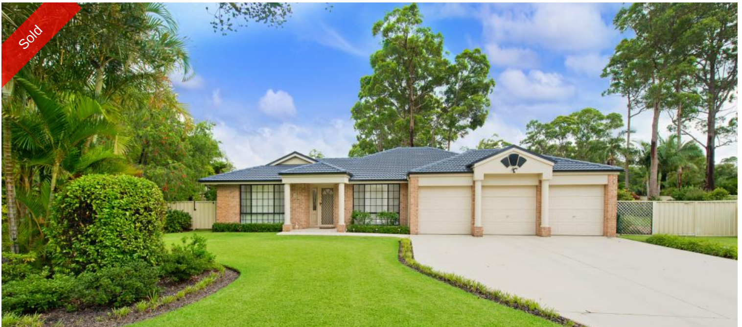
7 Fishermens Way, Lake Cathie