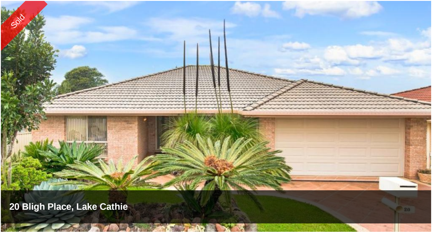
20 Bligh Place, Lake Cathie