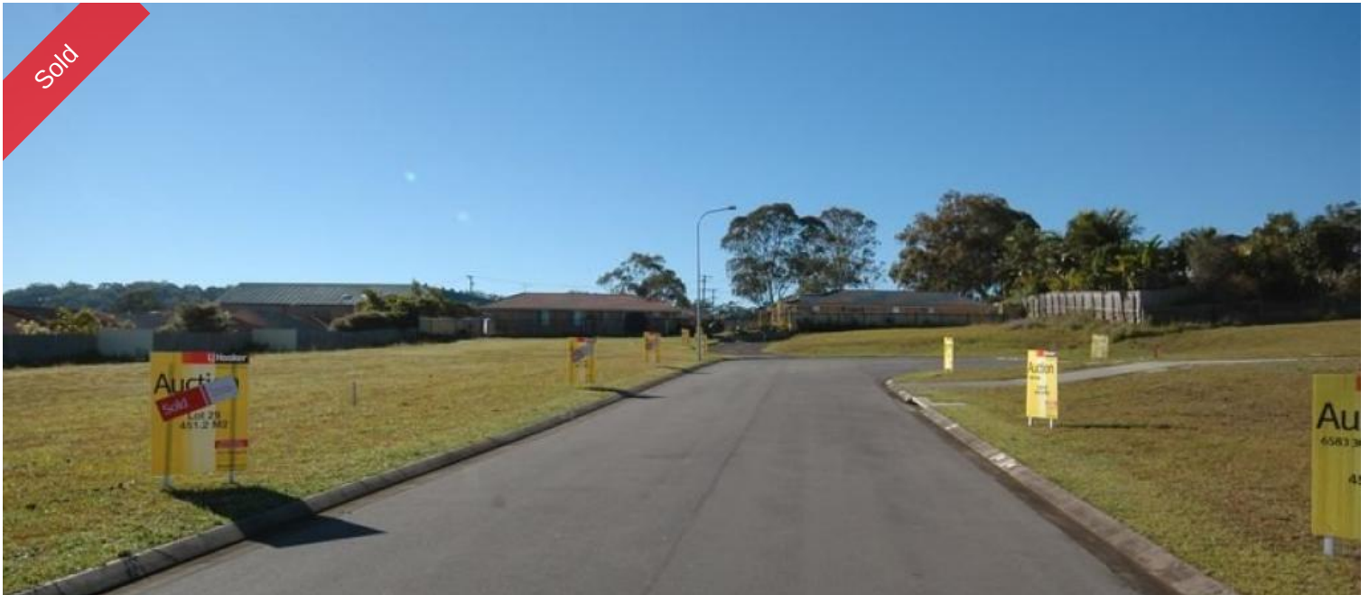
Lot , Lot 29 Friar Close, Port Macquarie