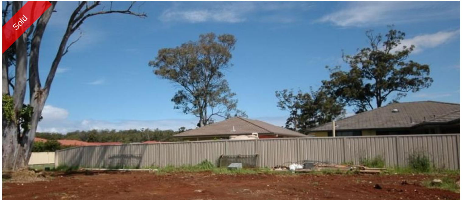
Lot , 44 Rivergum Drive, Port Macquarie