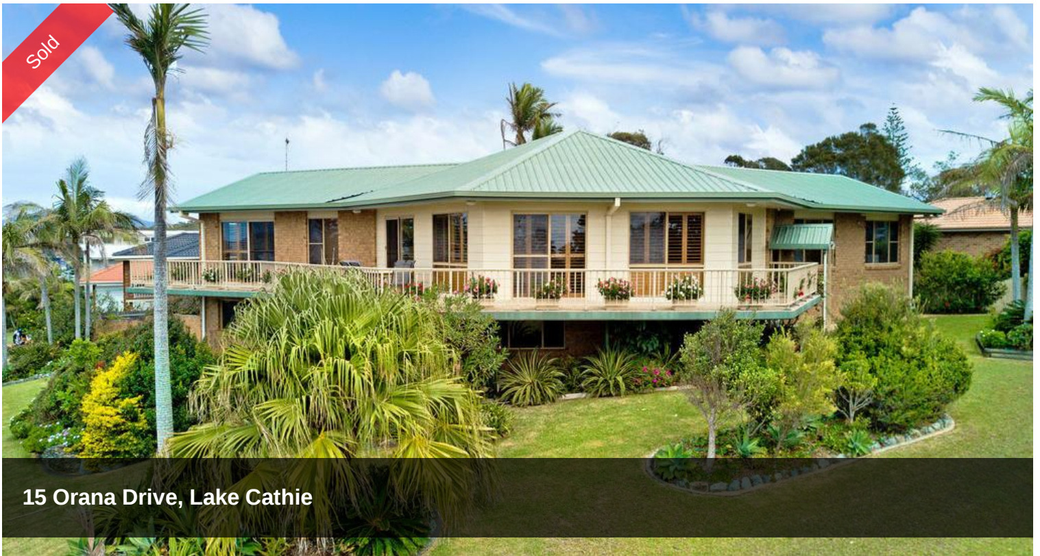
15 Orana Drive, Lake Cathie