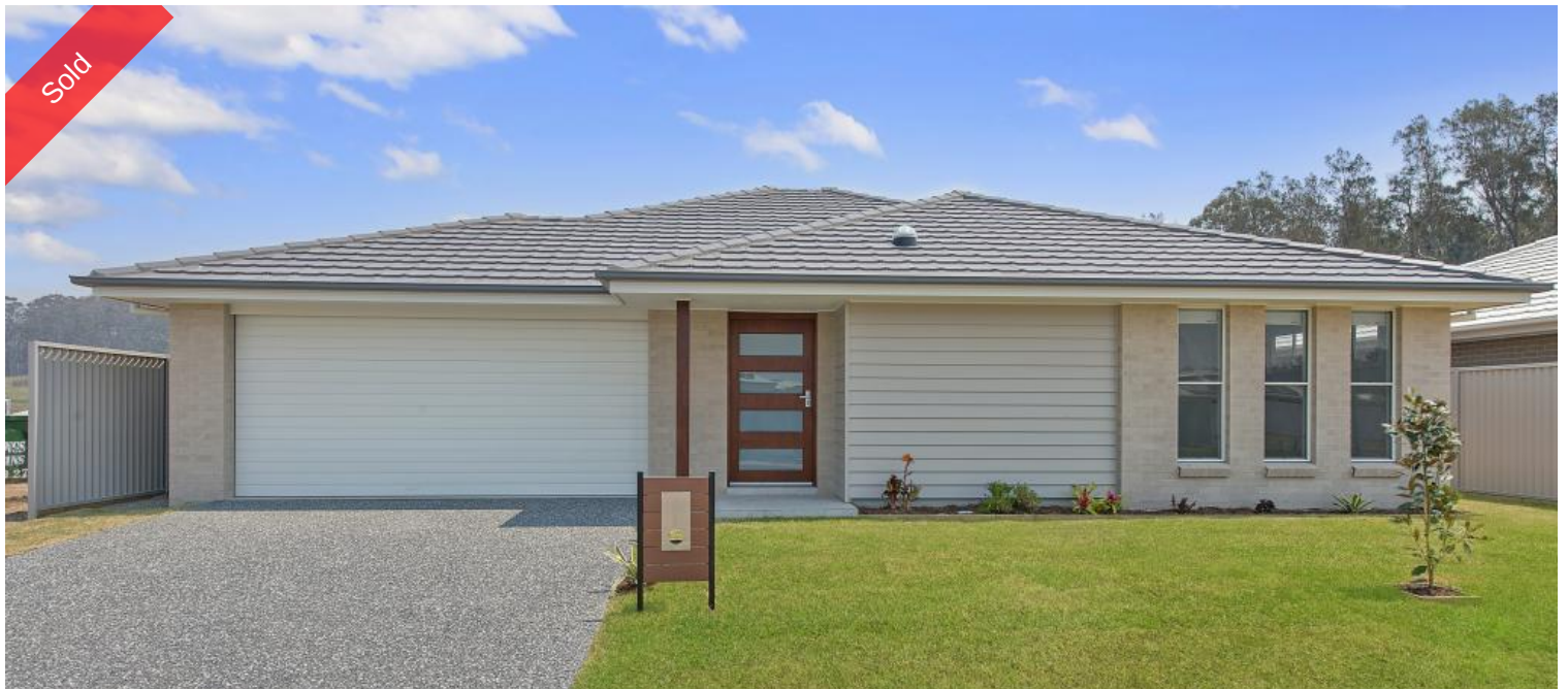
21 Seahorse Rise, Lake Cathie