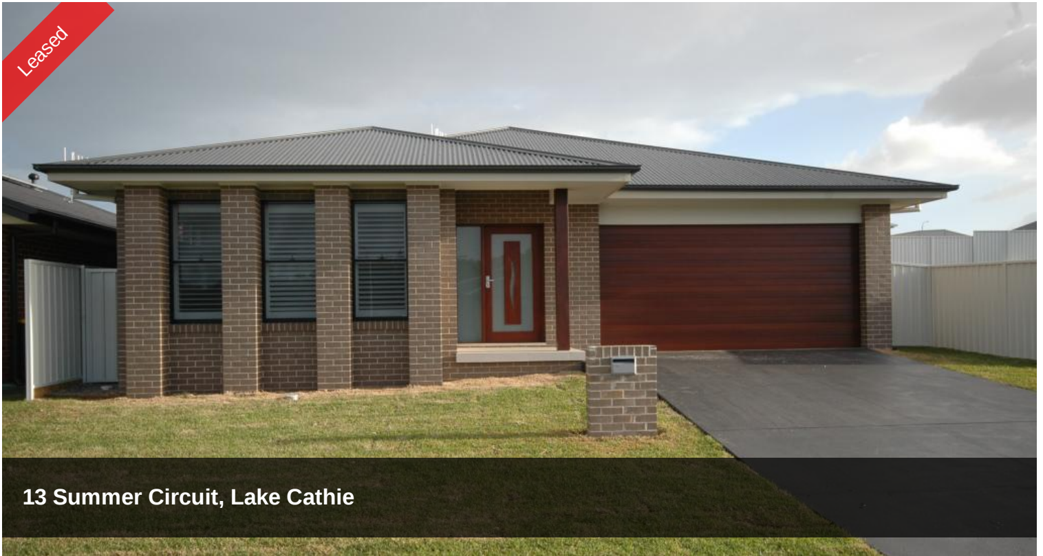
13 Summer Circuit, Lake Cathie