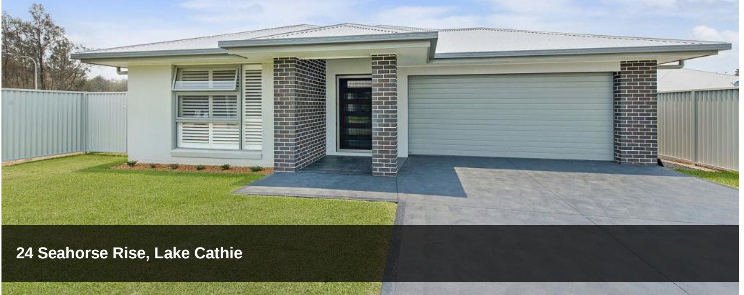
24 Seahorse Rise, Lake Cathie