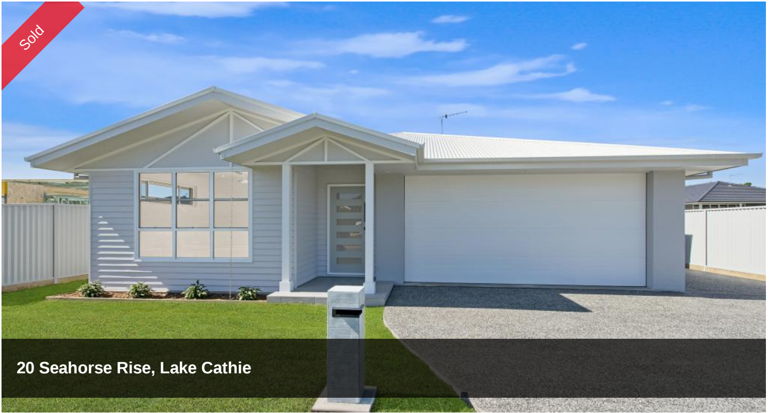
20 Seahorse Rise, Lake Cathie