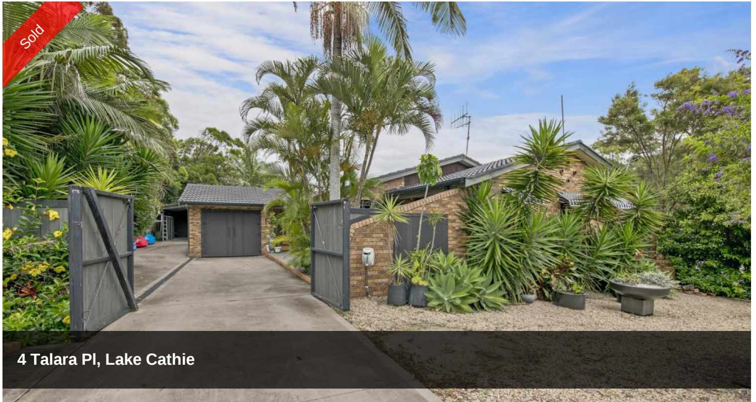
4 Talara Pl, Lake Cathie