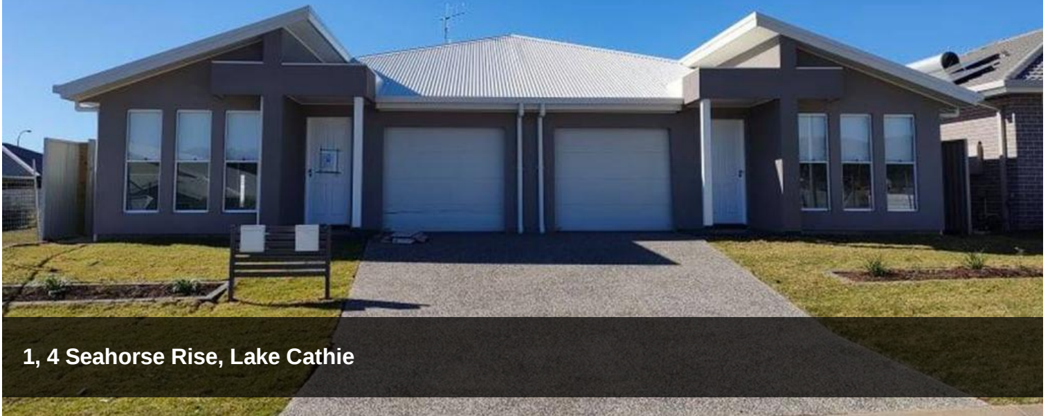
1, 4 Seahorse Rise, Lake Cathie