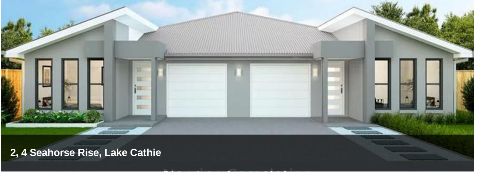
2, 4 Seahorse Rise, Lake Cathie