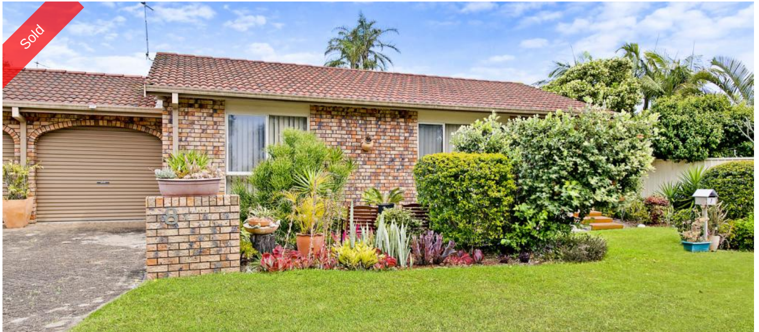
Unit 1, 8 Dirah St, Lake Cathie